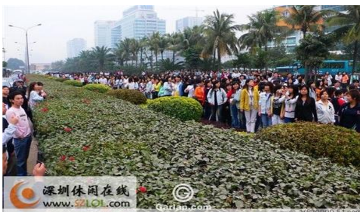
Nearly 1,000 workers from Shenzhen's Hailiang Storage Products firm block a downtown thoroughfare, 19 December 2007

public protest in the hope of forcing the government to intervene on their behalf. At least nine of the cases in this report were triggered by arbitrary management changes to wage structures and pay rates, workloads and working hours.