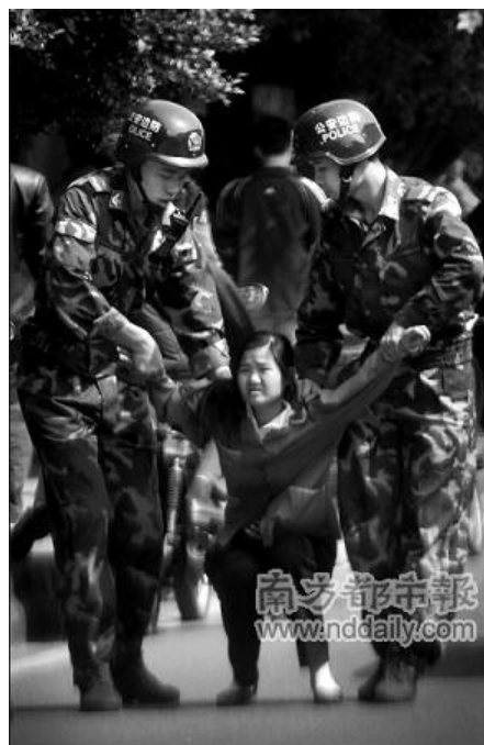
Riot police remove a female worker at a street demonstration during a strike on 6-7 March 2008 by several thousand workers at Casio Electronics, Guangzhou.

The Chinese government has a well-thumbed playbook for dealing with “ mass incidents, ” based on the 2007 Emergency Response Law , Article 52 of which requires local police and security forces to restore order as quickly as possible after a mass incident that “severely jeopardises public order.” An analysis of the 100 cases in this report shows that the measures taken by local government nationwide to deal with workers’ collective protests were basically in line with the central government’s emergency response measures and legislation. After a strike breaks out, the local government sends in the police to seal off the main factory entrance and prevent workers from getting on to the streets, staging demonstrations or blocking roads, railway lines or bridges. When a blockade does occur, riot police may be called in to persuade participants to abandon the action and allow resumption of traffic. Should the protesters refuse to comply, police may forcibly disperse them.